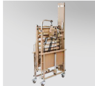
Compact delivery and storage on storage aid/transportation aid (similar to illustration).