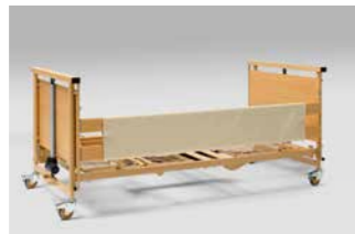
Foam leather cover.