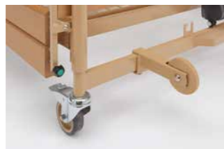
Wall deflection roller including holder.