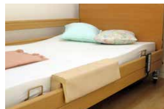
Extension cushion to place over the full-length safety side.