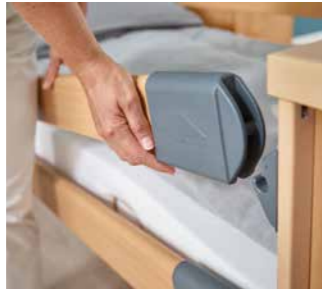
Tool-free safety side installation with Easy Click system.