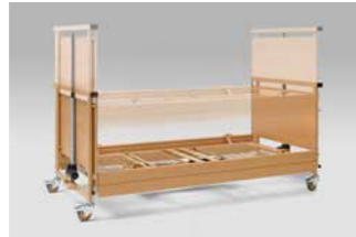
Adjustment range from 30 to 80 cm.