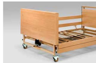
Wooden panels to cover the chassis (also for retrofitting).