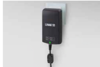
Electronic (SwitchMode) power supply unit integrated immediately downstream of the mains plug.