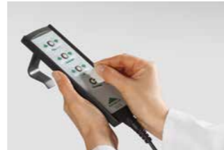
Handset with selective locking function.