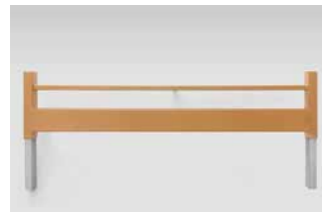
Bed extension (also for retrofitting).