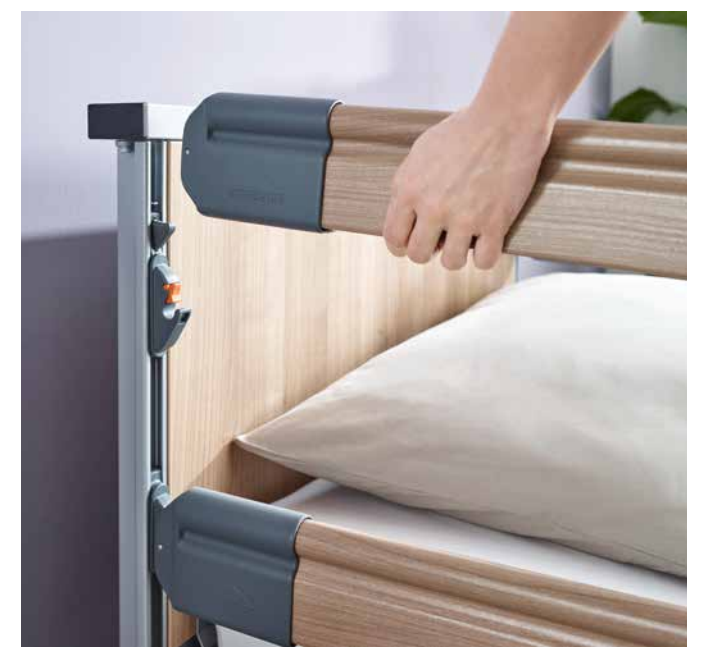
▲ The Easy Click system makes for easy and effortless assembly and dismantling.