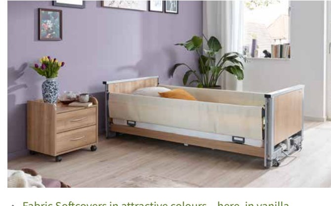
▲ Fabric Softcovers in attractive colours – here, in vanilla – encase the safety side.