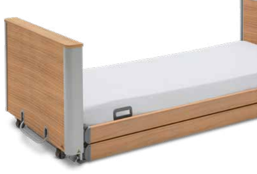
Wooden surrounds attractively encase the headboard and footboard.

For maximum well-being, we recommend the comfort mattress base made of 50 free-floating spring elements.