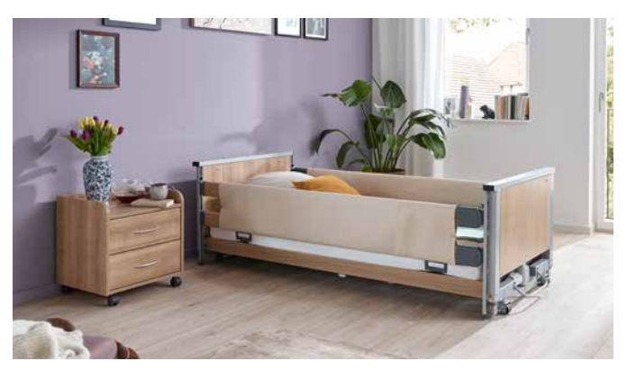
▲ Foam leather covers protect from knocking against the safety sides.