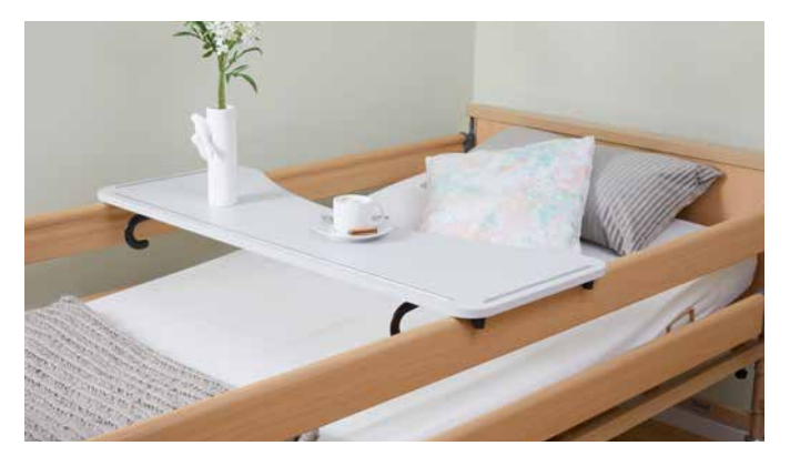
▲ The practical tray for enjoyable mealtimes.