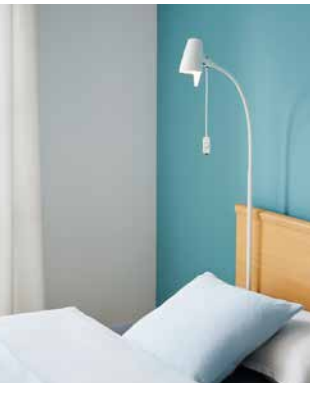
▲ Reading lamps can be inserted into the sleeve or attached to the patient lifting pole.