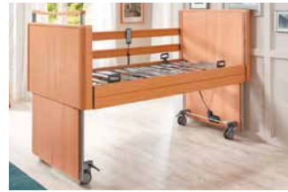
Mattress base height adjustable from 22 to 77 cm, adjustment range = 55 cm.