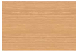
Natural Beech (standard).