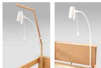
Sola reading lamp.