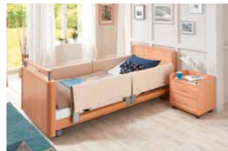
Foam leather cover for TSG.