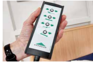
Handset with selective locking.