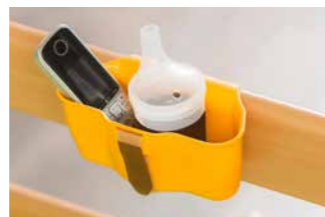
The storage tray for glasses, mobiles or care utensils can be attached to the full-length safety side.