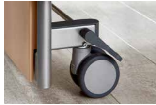
Castors can be locked in pairs whatever the mattress base position.