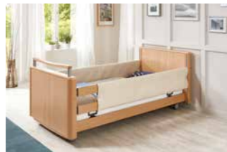
Foam leather cover for DSG.