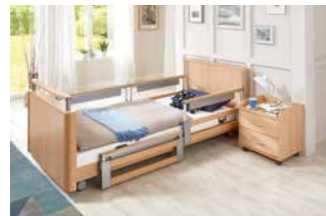
Telescopic safety side (TSG).