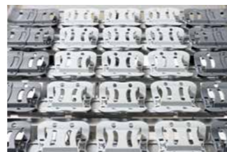
The comfort mattress base comprises 50 free-floating spring elements.