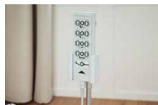
Flexible transmitter holder for the handset.