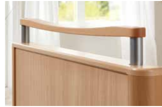
Solid wood handle bar.