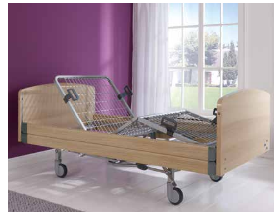
▲ The 4-section wire mesh mattress base is both sturdy and flexible.