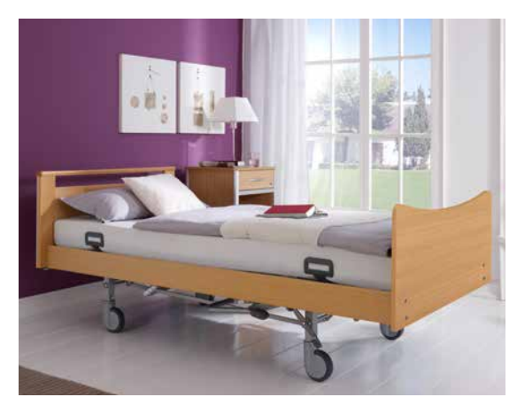
▲ Without safety sides the Classiko is ideal for

The Classiko is easy to move and manoeuvre. Thanks to its centrallocking castors, care staff can lock or unlock all four castors at once by pressing just one brake pedal. The eletrically model is operated using a handset, which shows all of the options as easily understandable pictograms. Individual functions can be blocked for the resident's safety, if required.