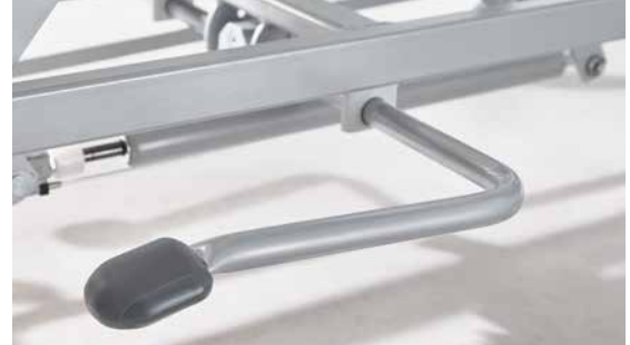
▲ Bed adjustments on the mechanical model use a pedal and are hydraulically assisted.

The Classiko can be adapted to suit any room with a variety of attractive decors to choose from.