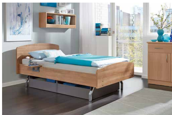
Optional bed drawers offer storage space under the bed. ▶

The Carino has a sleek and elegant design and can be adapted to your own personal taste with a wide range of available headboard and footboard forms and wood decors to choose from. The textile Softcovers for the headboard, footboard and sides are an especially cosy design feature of the bed. Fabrics in attractive colours and patterns can be used to transform the Carino into the centrepiece of the room. With an optional fixed board along the side of the bed, the Carino can also function as a comfortable sofa during the day.