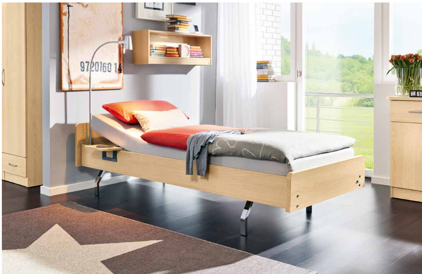
▲ The Carino in a combination of a Nobla reha headboard and a Nobla mala footboard, with a side tray attached to the bed frame.