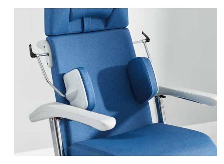
▲ Optional side rests promote an upright sitting position.