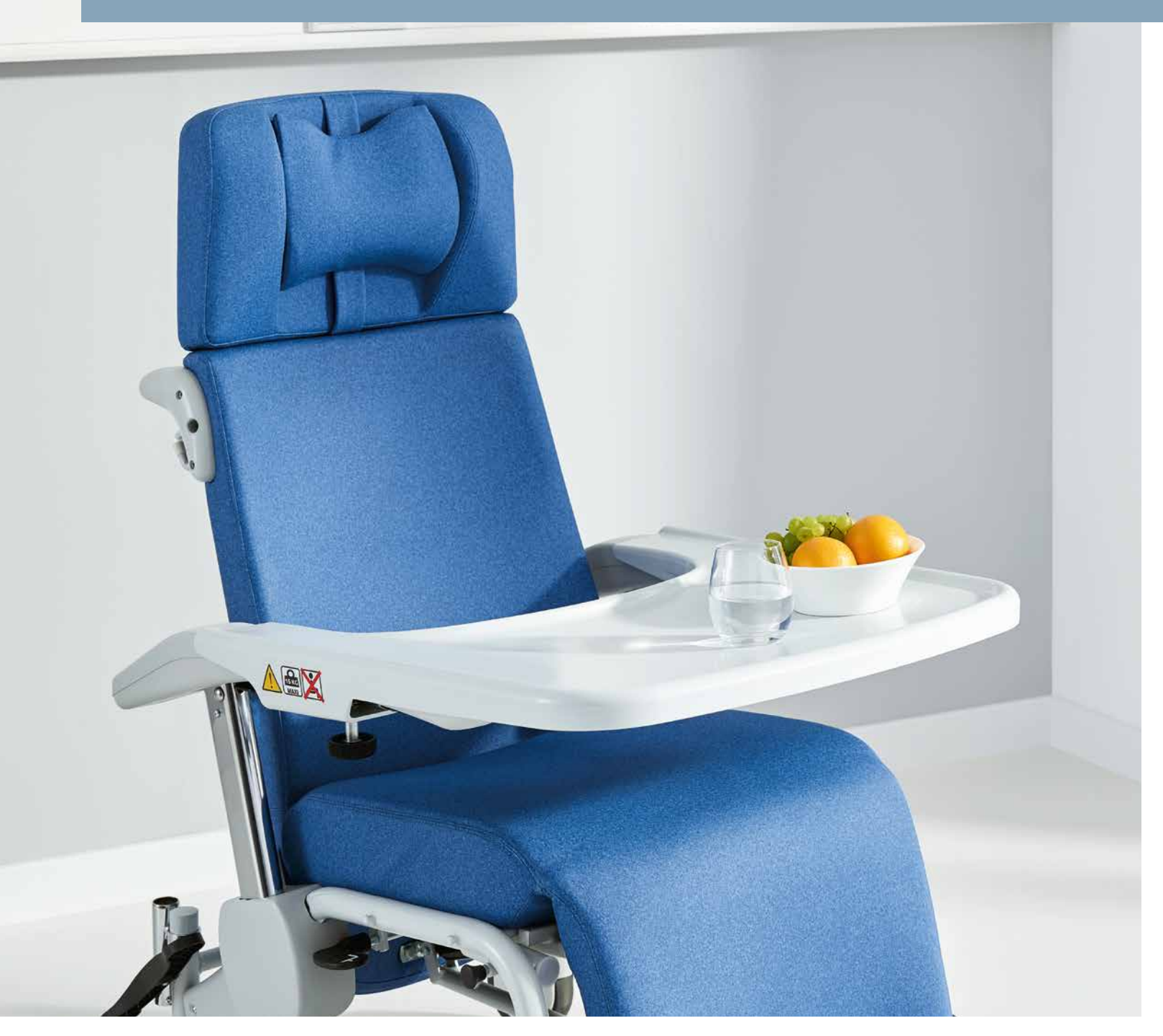
▲ The optional tray can simply be attached to the armrests.