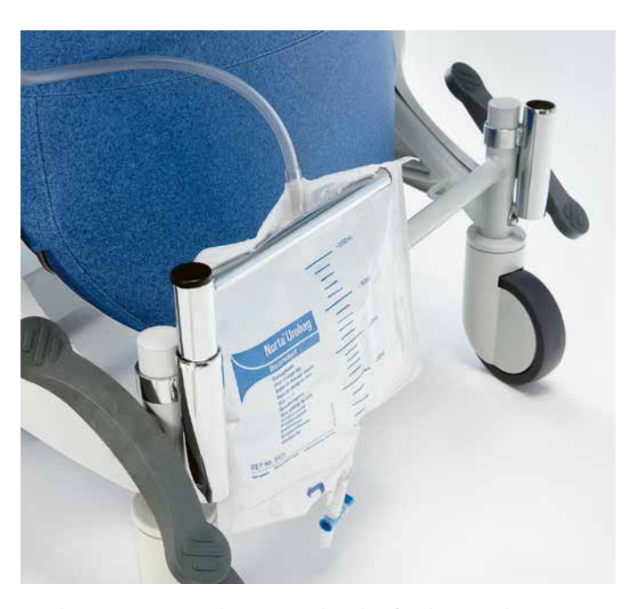
▲ There is an optional mounting bracket for drainage bags.