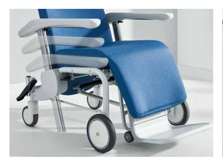
▲ The lowerable armrests allow unobstructed access from the front and the side.

A substantial standard model and innovative accessories transform the Ravello into a transport chair which people are happy to spend time in. The Ravello also allows medical aids to be attached securely and discreetly. All Ravello models are available in a radiant cobalt blue. The upholstery is resistant to standard disinfectants used in hospitals (concentration according to the list of the German Society for Hygiene and Microbiology, DGHM).