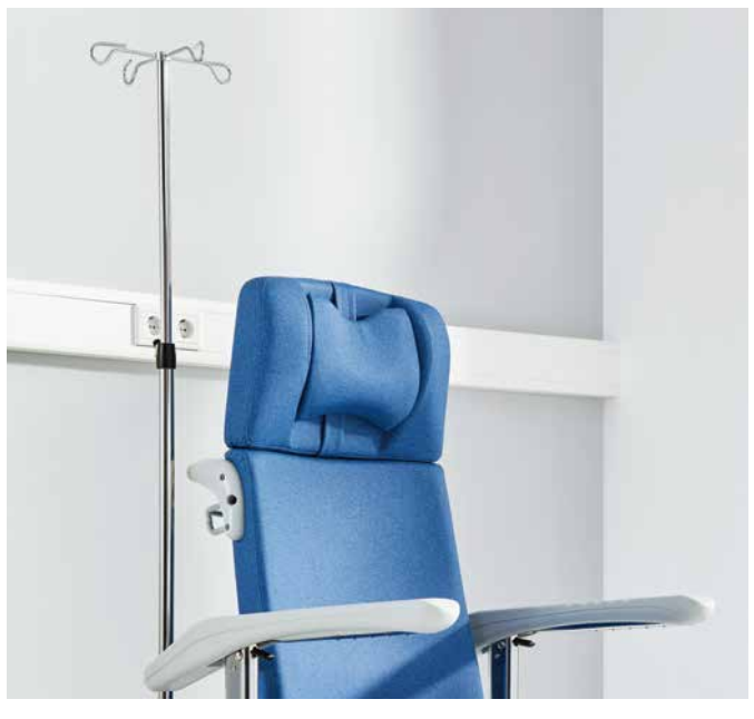
▲ Infusion stands can be inserted on both sides using the sleeves supplied as standard.