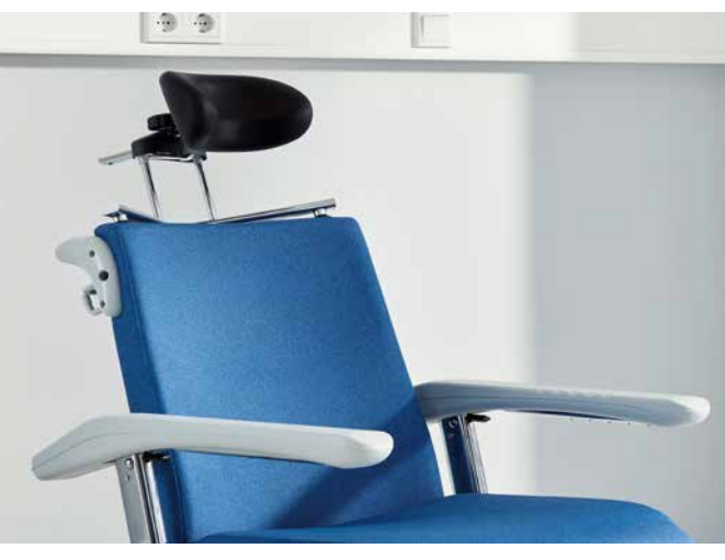
▲ If the user requires additional support whilst sitting, there is a special headrest with lateral support available.