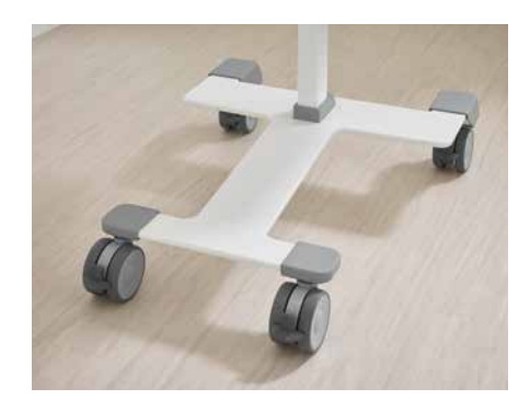
▲ The chassis ensures high stability and straightforward cleaning.