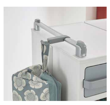
▲ With the longer hook toiletry bags can also be stowed close to the patient.