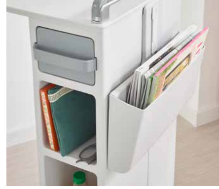
The optional additional compartment is suitable for magazines and further personal