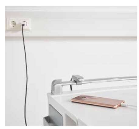
▲ An attachable USB extension cable allows charging of mobile devices in reaching distance of the patient.