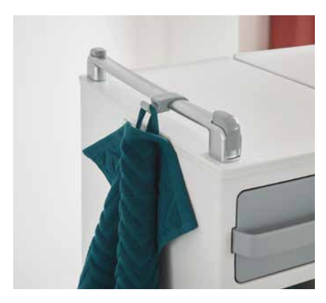
▲ With a towel hook on the rail of the bedside cabinet the towel is always at hand for the patient.