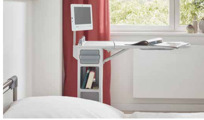
▲ ► The optional sleeve for telephones and multimedia systems allows action in accordance with the patient's needs and the rooms' features.