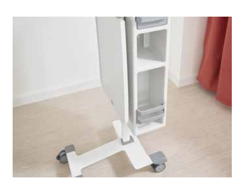
▲ The hygiene-friendly design of the Quado lends itself to easy and thorough reprocessing.