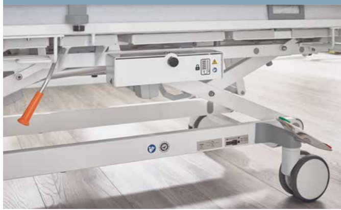
▲ In a lockable compartment, the optional handset is protected from unintentional use.