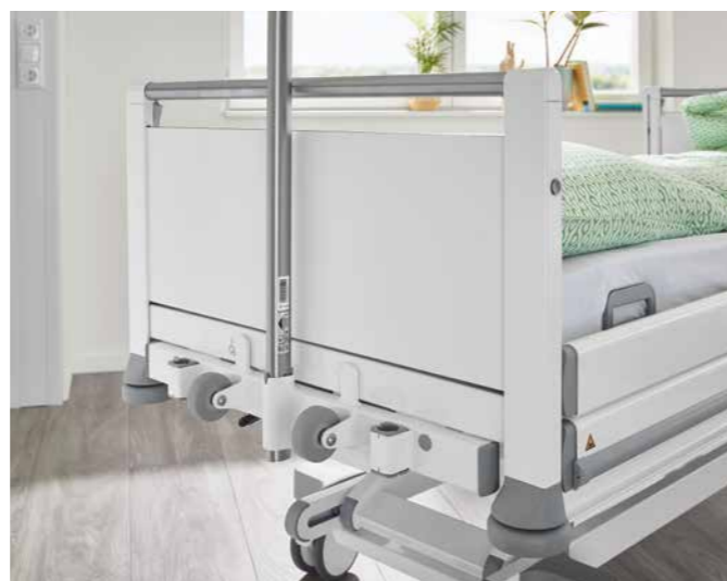
▶ The patient lifting pole on the outside of the bed promotes good patient care.