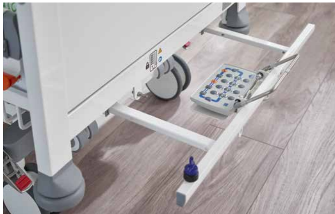
▲ The linen holder can be slid in and locked to keep the control box safe from improper use.