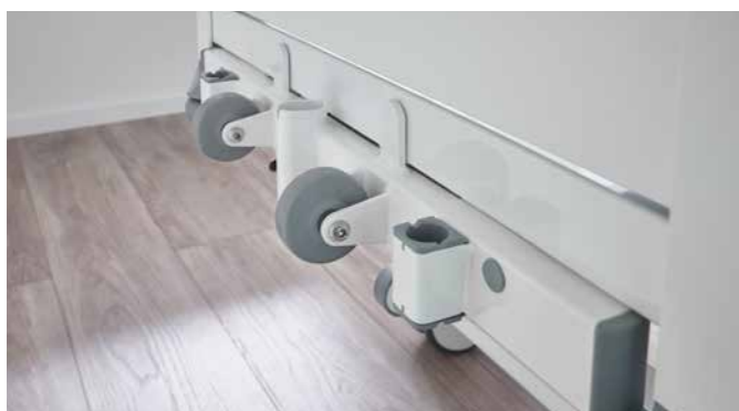
▲ The rollers at the head end protect the wall and the bed from damage.