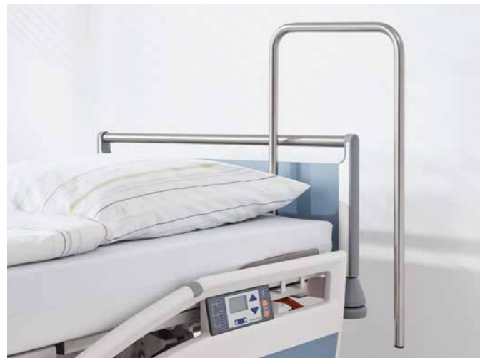
▲ The mounting bow is suitable for use in intensive care units.

If there is a patient lifting pole on the bed, a self-locking infusion holder with 4 hooks can be attached to it. For our Mobilo stretcher , a double telescopic infusion stand is available, which can be attached to all 4 corners and can be stowed away at the foot end when not in use using an optional holder. Thanks to its swivelling hooks, it takes up little space there. The sturdy mounting bow is particularly suitable for the intensive care unit, and medical equipment can be securely attached to it.