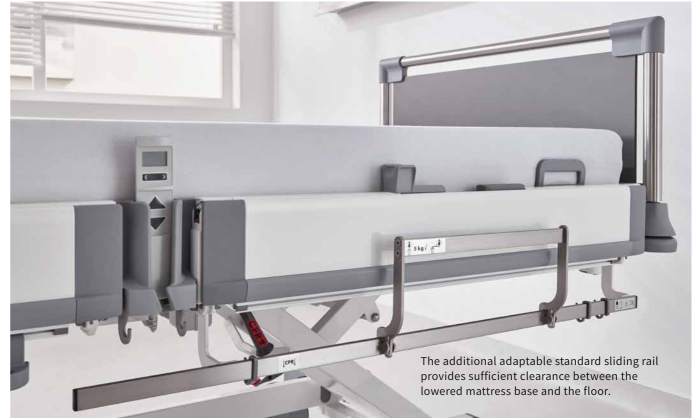
The additional adaptable standard sliding rail provides sufficient clearance between the lowered mattress base and the floor.