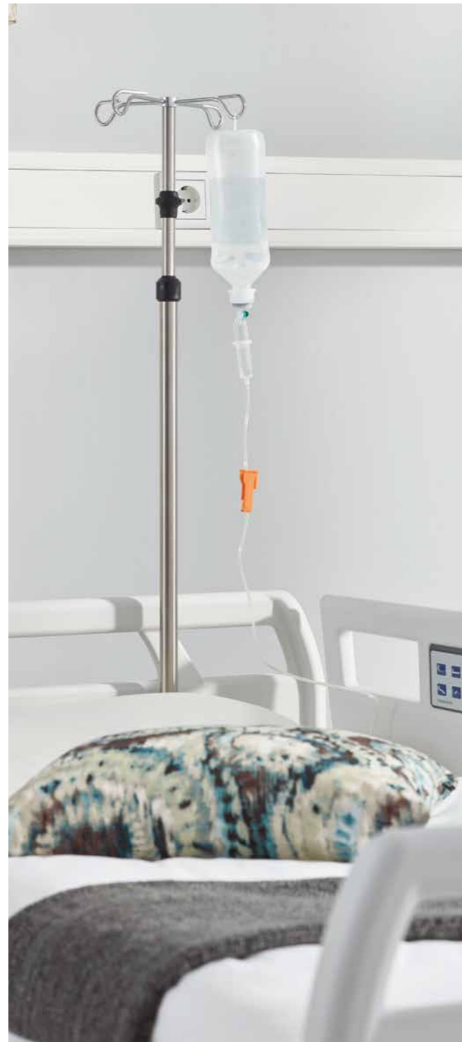
▲ The vertical infusion stand is the classic standard solution.