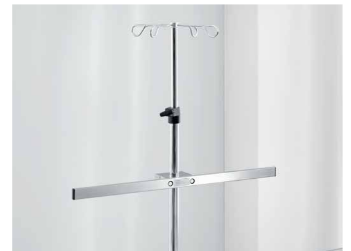
▲ The standard sliding rail for the infusion stand enables accessories, such as infusion pumps, to be positioned at eye level in a space-saving way.