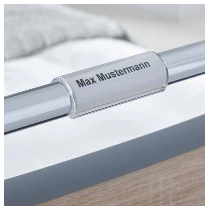
▶ The plastic name tag holder can be positioned flexibly.

Being able to address patients by name provides reassurance and an atmosphere of trust and is a help for doctors on their rounds. Our plastic name tag holder for a name tag is practical and hygienic.