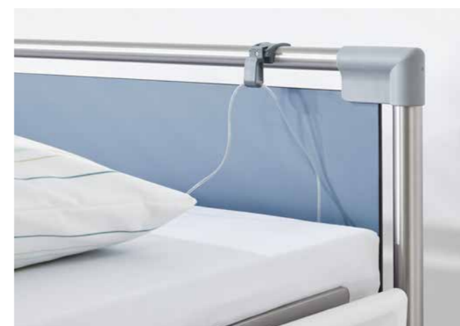
◀ The drainage tube holder can be attached to the handle bars of the head and footboards.