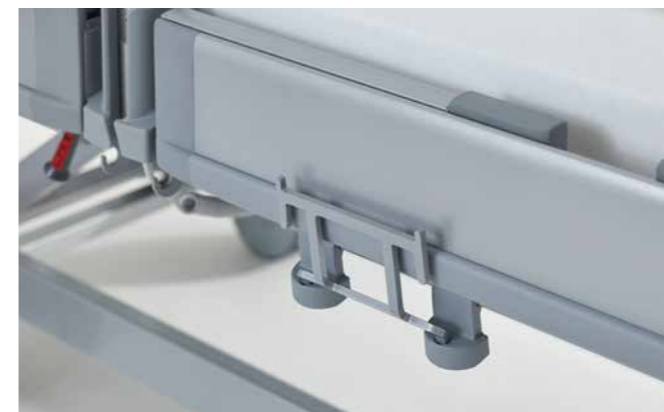
▲ The universal accessory holder on the Puro hospital bed with flexible attachment heights for the low-height adjustable mattress base