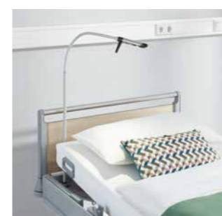
Lamps Directly on the bed