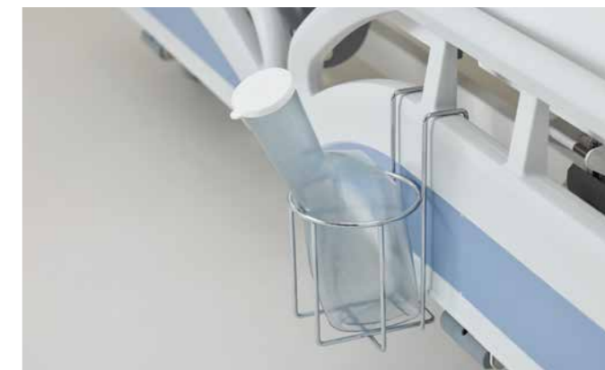
▲ The urine bottle holder for the Protega safety side on the Evario.