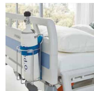
Secure hold for oxygen bottles