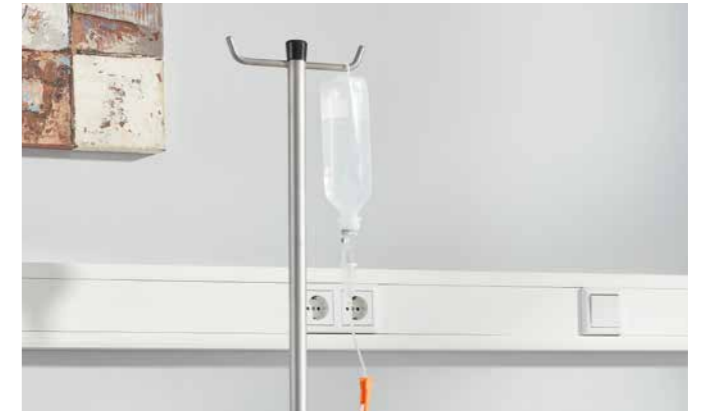
▲ The heavy-duty infusion pole carries loads of up to 10 kg per hook.