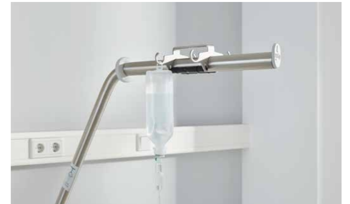
▲ The infusion holder with 4 hooks can be attached to the patient lifting pole.