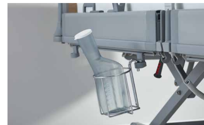
▲ The urine bottle holder for attaching to the side of the bed.