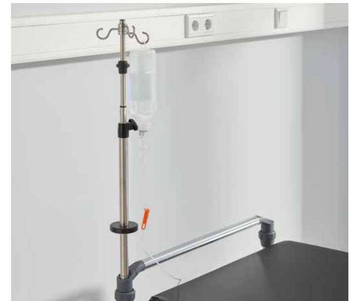
▲ The telescopic infusion stand for the Mobilo stretcher can be stowed away at the foot end in a space-saving way.