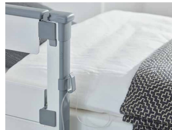
▲ A tube holder is also available for the mobilisation support of the MultiFlex safety side.

Our standard sliding rails enable, among other things, the positioning of drainage bags close to the patient. Practical drainage tube holders are available to secure the drainage tubes additionally. They ensure that the tubes cannot be bent and can be laid in an orderly way. Holders are available for attaching to the handle bars of the headboards or to the mobilisation support on the MultiFlex safety side.