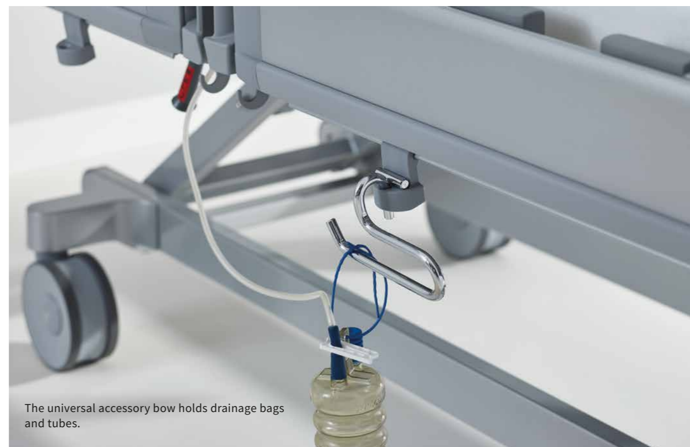
The universal accessory bow holds drainage bags and tubes.

Urine bottles should be easy to reach whenever necessary and reliably prevented from tipping over. Our urine bottle holders are ideal for meeting these requirements. We offer models with customised holders for a variety of hospital beds and equipment – for example, for MultiFlex ® safety sides on our Puro, and Protega safety sides on the Evario.