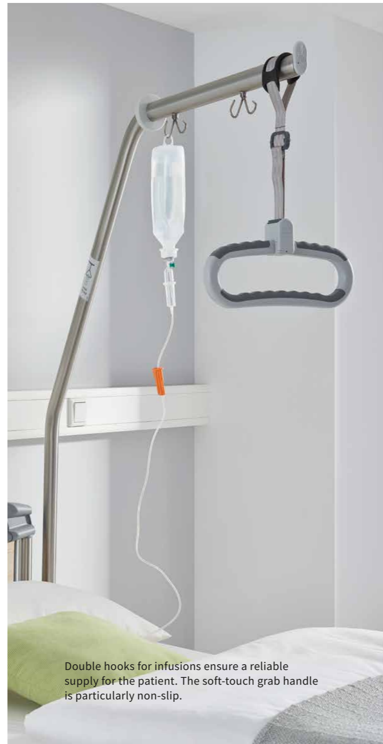
Double hooks for infusions ensure a reliable supply for the patient. The soft-touch grab handle is particularly non-slip.