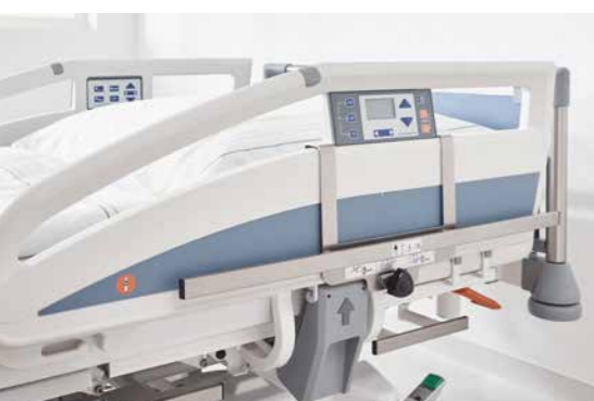
◀ Sliding rail on the Protega safety side.