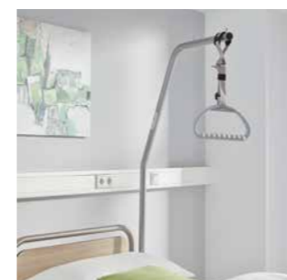
Patient lifting poles for comfort and support

Even the standard versions of Stiegmeyer's hospital beds offer a wide range of options. With the right accessories, they become tailor-made dream beds that cater to the patient's needs and considerably relieve the burden on care staff. The central focus is on optimal medical care, improving safety for the patient, and ensuring a higher quality of everyday life. The accessories can also be purchased retrospectively and easily attached or removed. Enhance your establishment's public image, improve the standard of patient care, and protect your valuable investments.