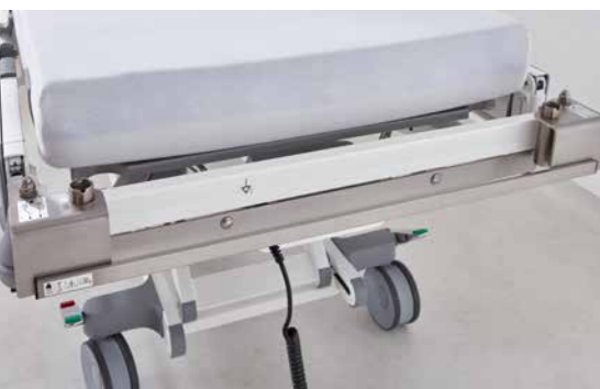
◀ Sliding rail on the bed frame (head end).