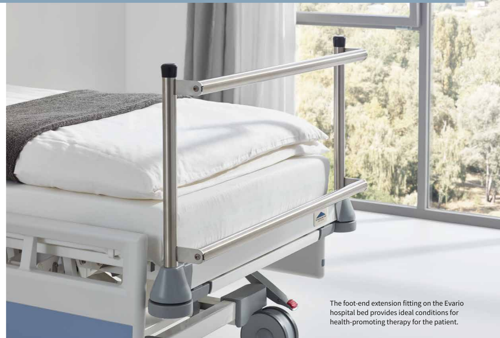
The foot-end extension fitting on the Evario hospital bed provides ideal conditions for health-promoting therapy for the patient.