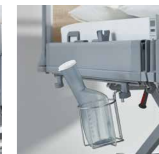
Universal holders and urine bottle holders