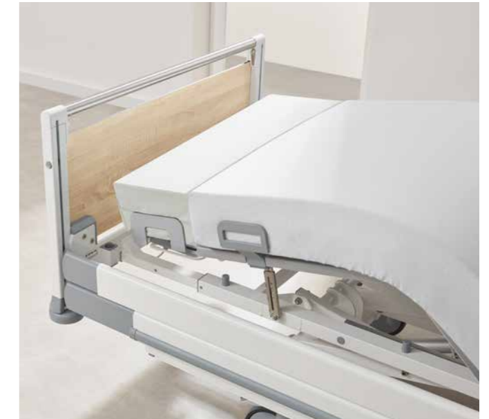
▲ The optional lower leg rest extension, with its matching mattress extension piece, moves together with the mattress base whenever this is adjusted, allowing even tall patients to benefit from a raised leg position.