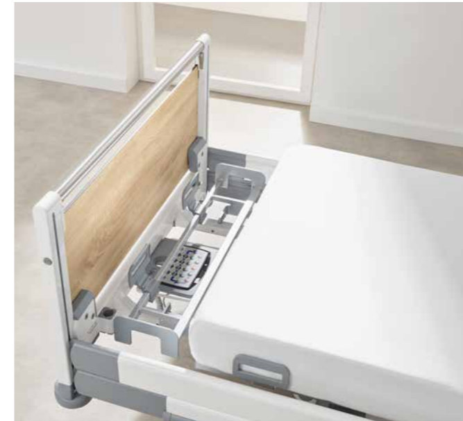
▲ On the Seta pro and many other models, an optional extension piece is easy to attach to the lower leg rest.