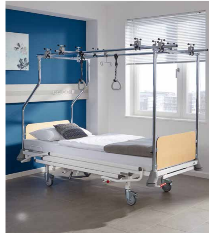
▲ If extensions are to be fitted above the patient, then the traction frame is ideal for this purpose. It offers longitudinal and transverse bars which can be variably positioned above the bed