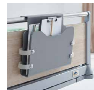
Accessories on the footboard Always up-to-date and at the ready