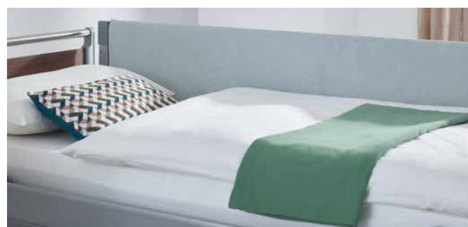
▲ The protective cover for the full-length safety side moves up and down with it when the bars are raised and lowered.