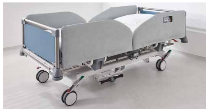
The protective cover pleasantly cushions the four ► Protega safety side elements.

▼ Beds without any safety sides can be retrofitted with 3-bar, full-length safety sides at any time.