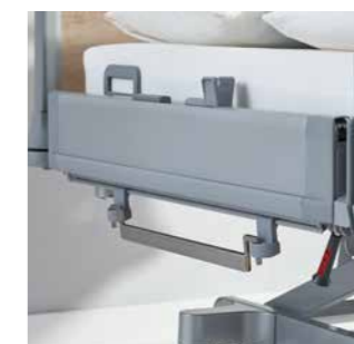
Standard sliding rails for intensive care