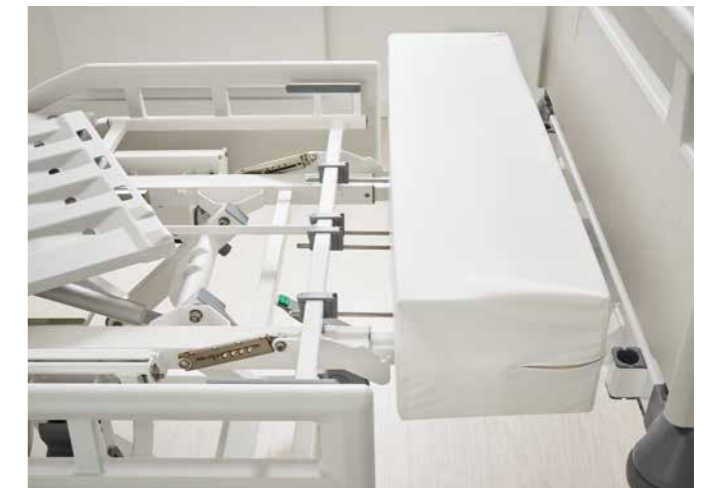
▲ Some beds, such as the Evario here, can be configured with an integrated extendible lower leg rest extension. A matching mattress extension piece is also available.