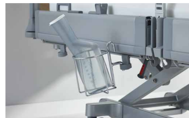
▲ The urine bottle holder for the Puro's MultiFlex ® safety side system with flexible attachment heights for the low-height adjustable mattress base.