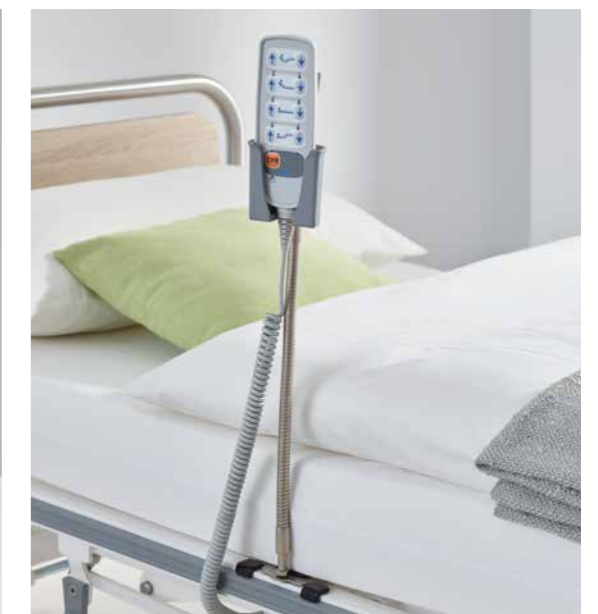
▲ With the flexible transmitter holder at the side of the bed, the handset is always within ideal reach of the patient.

◀ With a handset holder on the headboard or footboard, the LCD handset can be placed in or out of immediate reach of the patient.