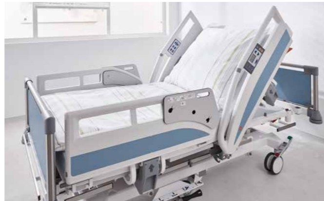
▲ This infill piece is available to increase the protective height in the middle section of the Protega safety side.

Foam leather padding is available for many safety side systems for even more comfort and safety. This feels soft and pleasant to the touch and can be reprocessed hygienically. The padding can be used on both full-length and split safety sides to protect particularly restless patients.