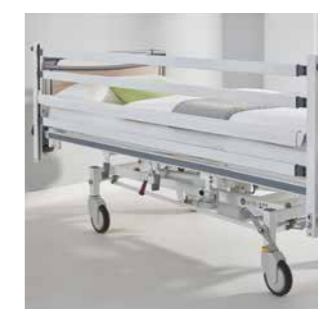
Safety sides for maximum protection