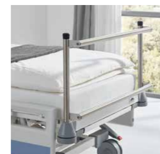
Precision fitting of extension devices