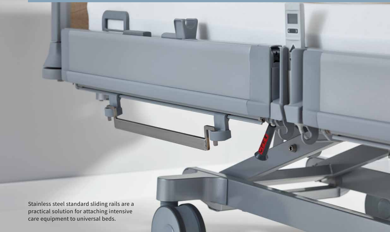
Stainless steel standard sliding rails are a practical solution for attaching intensive care equipment to universal beds.