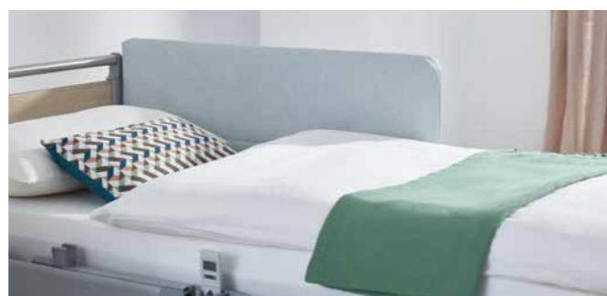
▲ The split MultiFlex+ safety side can also be fully encased in an upholstered cover.