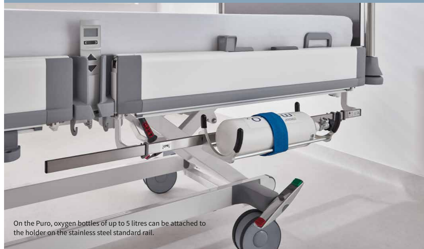
On the Puro, oxygen bottles of up to 5 litres can be attached to the holder on the stainless steel standard rail.