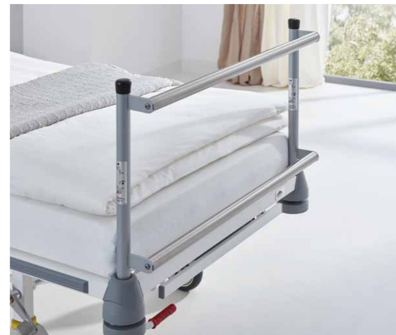
◀ The foot-end extension fitting can also be securely attached to the Deka hospital bed.

and precisely to the hospital bed. To make this possible, an exchangeable extension fitting can be attached to the bed in place of the footboard – for example, to the Evario or Deka. Its two sturdy poles provide an ideal hold for the devices.