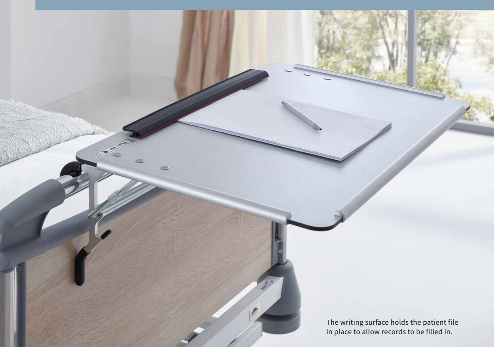
The writing surface holds the patient file in place to allow records to be filled in.