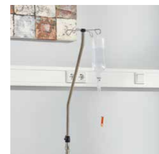
Infusion stands for a reliable supply