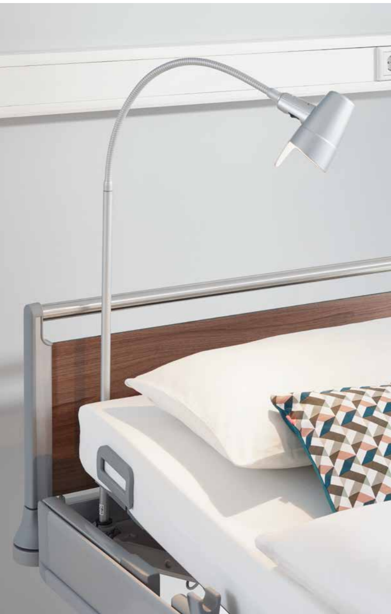
▲ The Sola lamp has an attractively shaped lamp head made of unbreakable plastic.

Both LED and halogen models of the Sola reading lamp are available. In both cases, the lamp head is made of shatterproof plastic. Vents and heat dissipating cylinders ensure that heat build-up remains low.