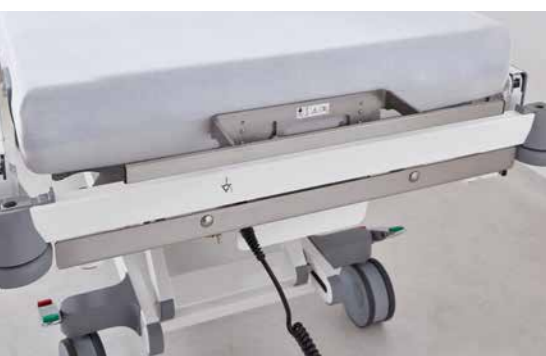
◀ Sliding rail on the backrest.