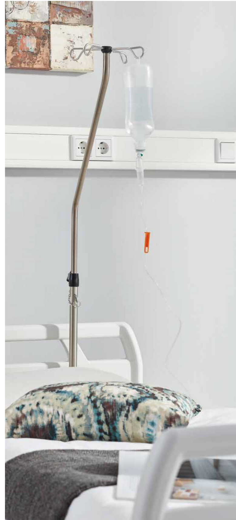
▲ The infusion stand with a 45° bend prevents collisions when adjusting the bed.