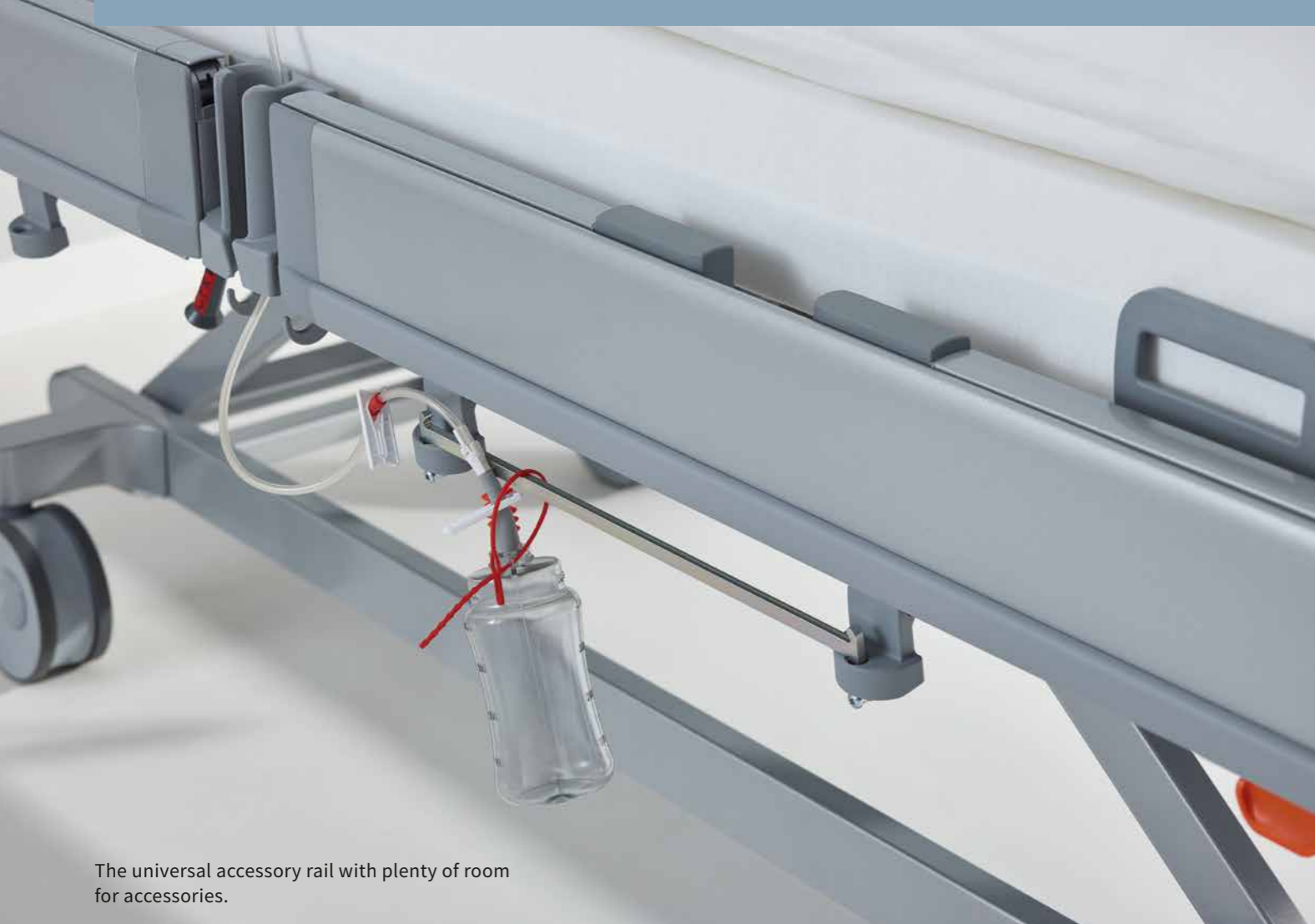
The universal accessory rail with plenty of room for accessories.