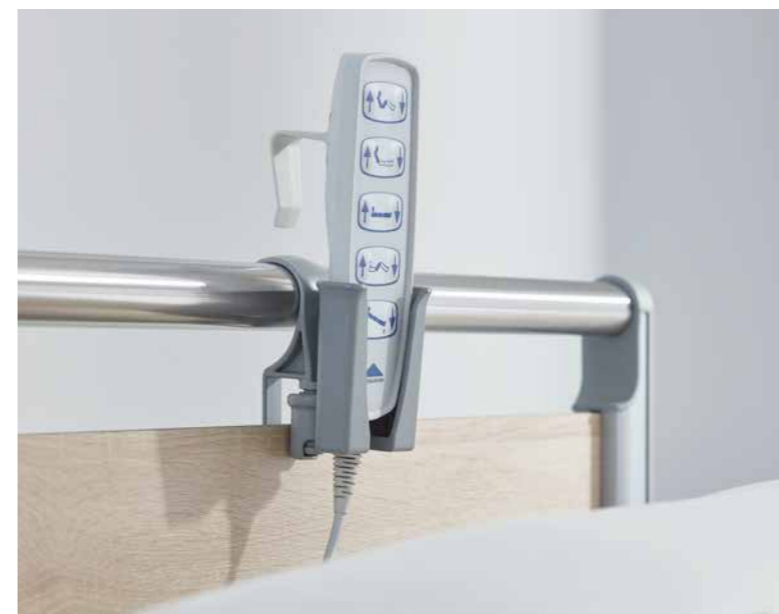
▲ There is also a tailor-made holder for the standard handset.

Handsets should always be within easy reach of patients and nursing staff. At the same time, they should be kept in a safe place on the bed to prevent any damage. Stieglmeyer hospital beds already offer practical fixing options as standard.