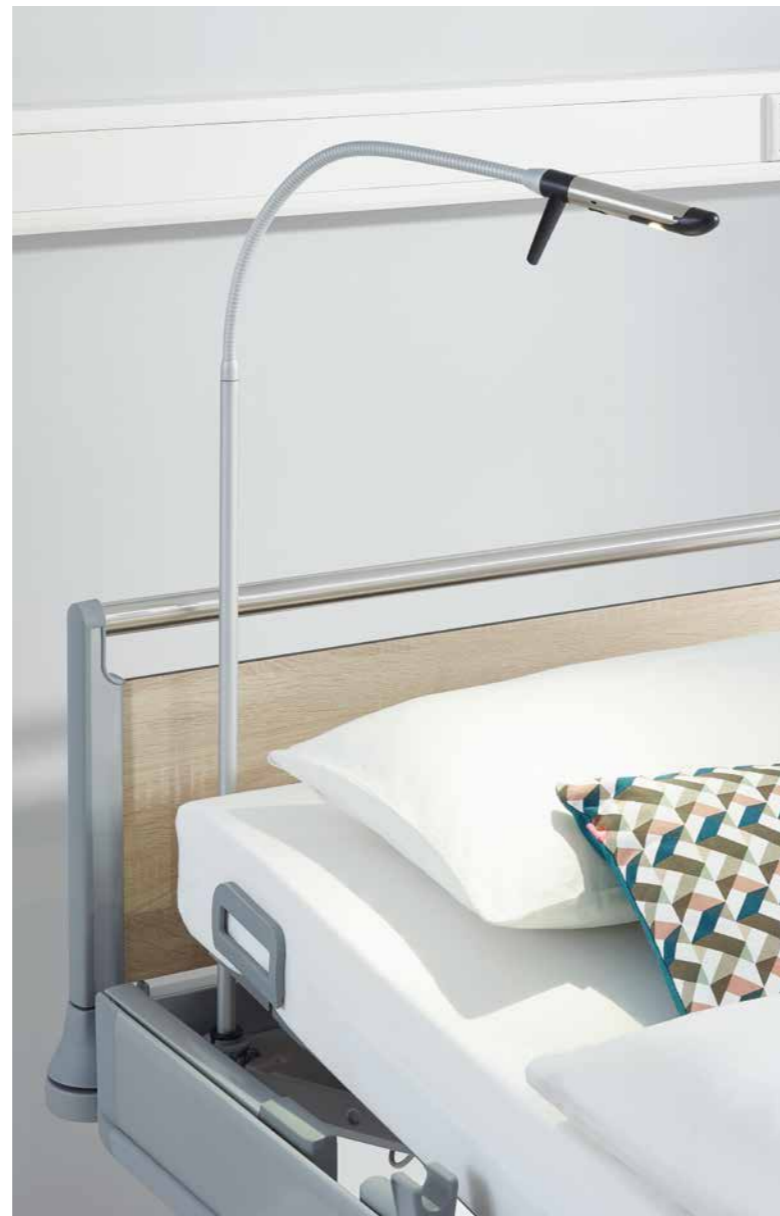
▲ Our Stella reading lamp provides pleasant, cosy lighting for patients – without disturbing other people in the room.

The Stella LED reading lamp combines high-quality design with a long service life. The lamp head is made of highly polished stainless steel and provides night-time orientation lighting. The Stella model is also available as a version for attaching to the bedside cabinet.