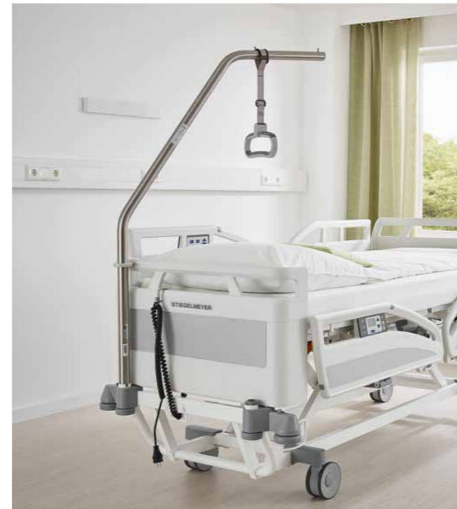
▲ Patient lifting pole on the Evario with a fixed headboard.