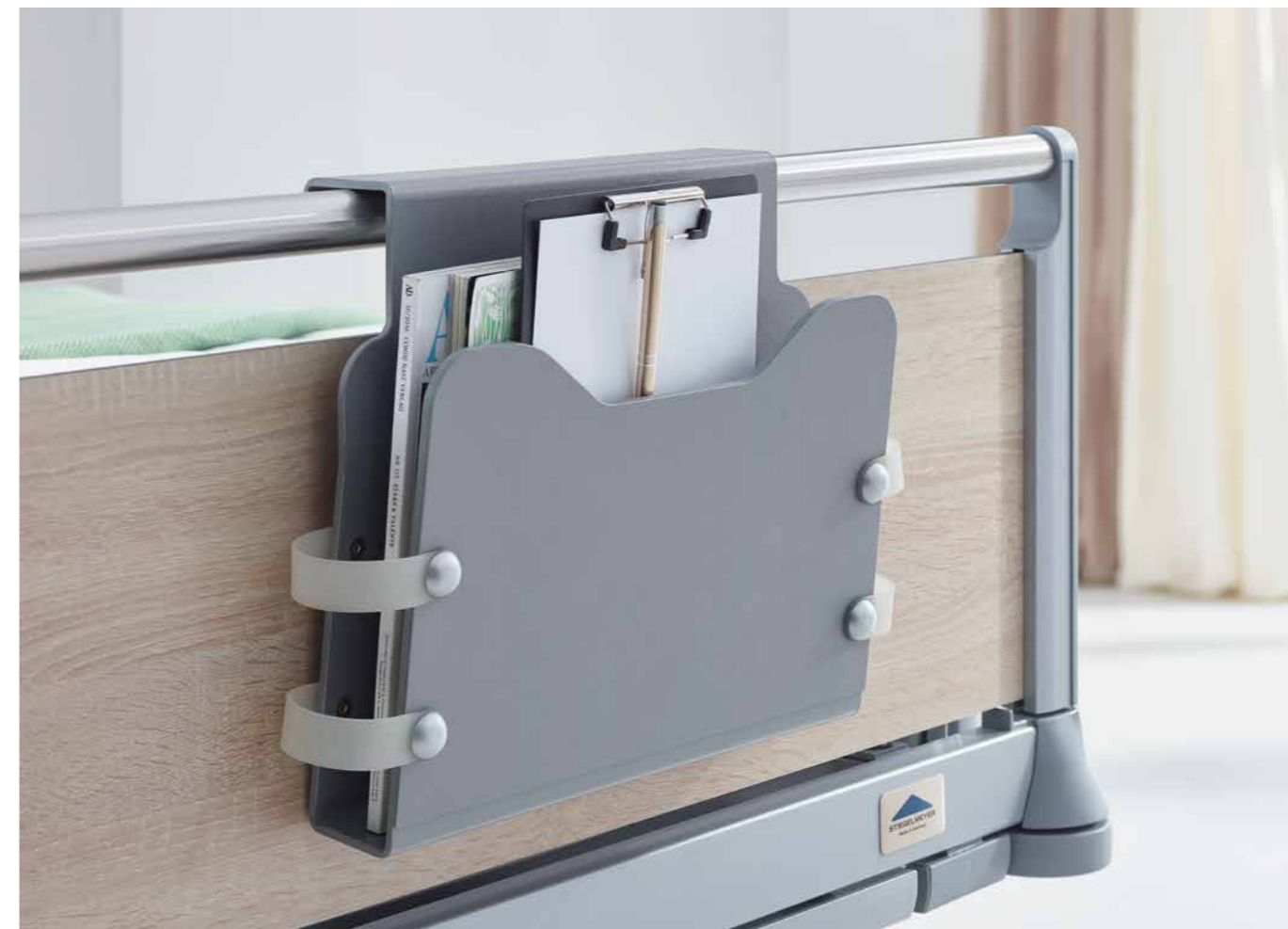
▲ The document holder in the modern Argentum colour goes well with every bed.