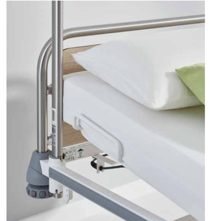
▲ The patient lifting pole can simply be inserted into the adapter sleeves at the head end on either side of the bed.