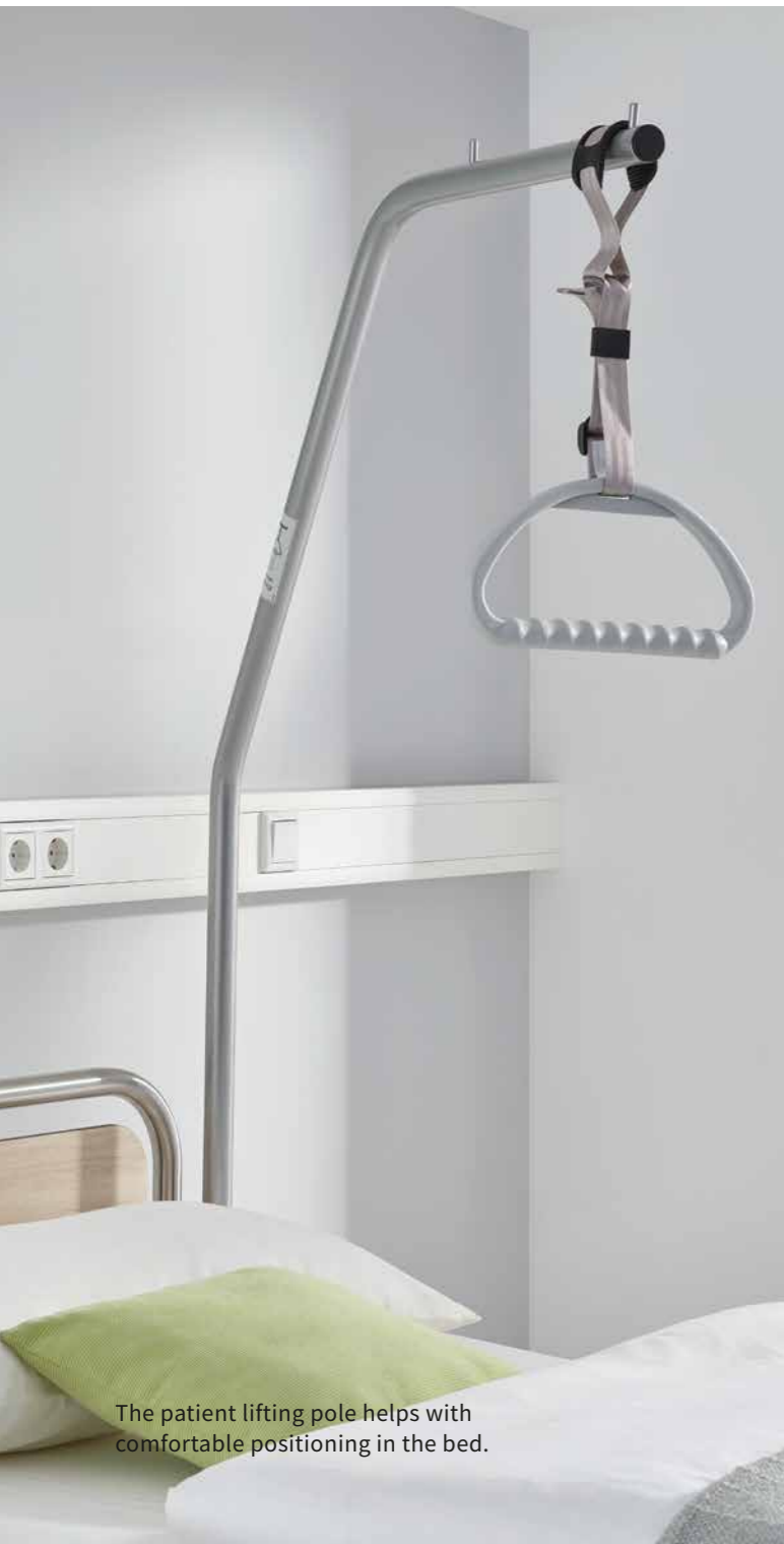
The patient lifting pole helps with comfortable positioning in the bed.

Crutches should always be close at hand. Our practical crutch holders are simply attached to the head and footboards of the bed or to the railing of the bedside cabinet.