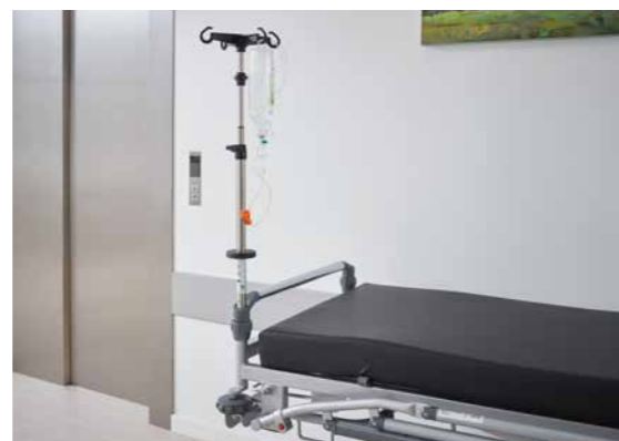
▲ The optional infusion stands are of double telescopic design and can be fitted to all four corners of the stretcher.

All care items required for treatment can be securely attached to the Mobilo both quickly and easily. This allows the Mobilo to be used flexibly as a stretcher or day bed.