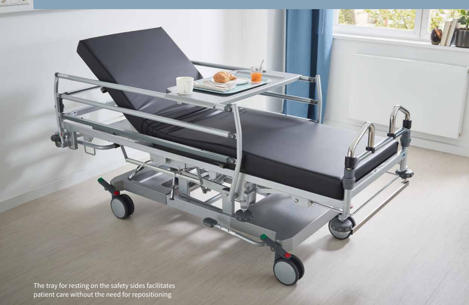
The tray for resting on the safety sides facilitates patient care without the need for repositioning