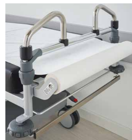
▼ Supply accessories can be attached to the sliding rails at the head and foot end of the stretcher.