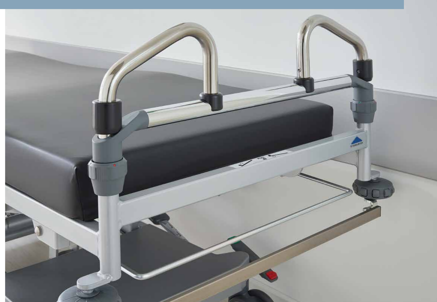
▲ The wide, ergonomically designed push bars at the head and foot end make it easy to manoeuvre the stretcher swiftly and easily.