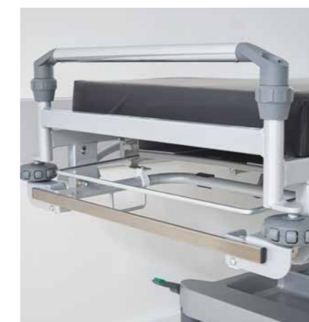
▼ Thanks to its radiolucent backrest and optional cassette holder, it is no longer necessary to reposition the patient.