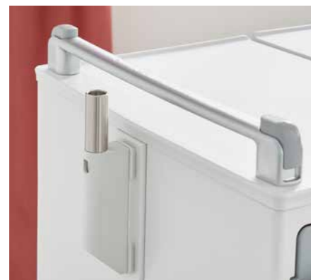
▶ ▲ The optional sleeve for telephones and multimedia systems allows action in accordance with the patient's needs and the rooms' features.