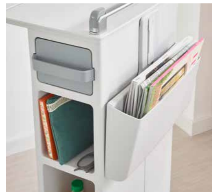
◀ The optional additional compartment is suitable for magazines and further personal items.