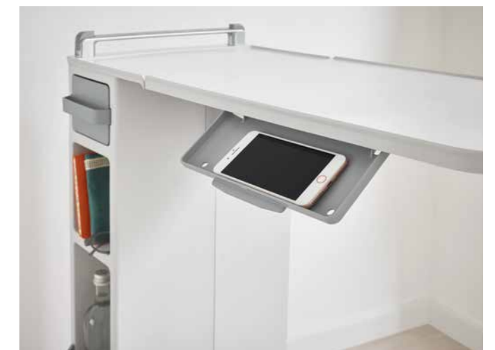
▲ The extendable bookrest under the overbed table top offers the patient high reading comfort, without having to clear the table (optional).