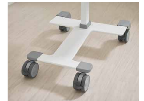
▲ The chassis ensures high stability and straightforward cleaning.

The Quado is machine washable and can also be easily cleaned manually. This ensures optimum hygiene in the hospital.