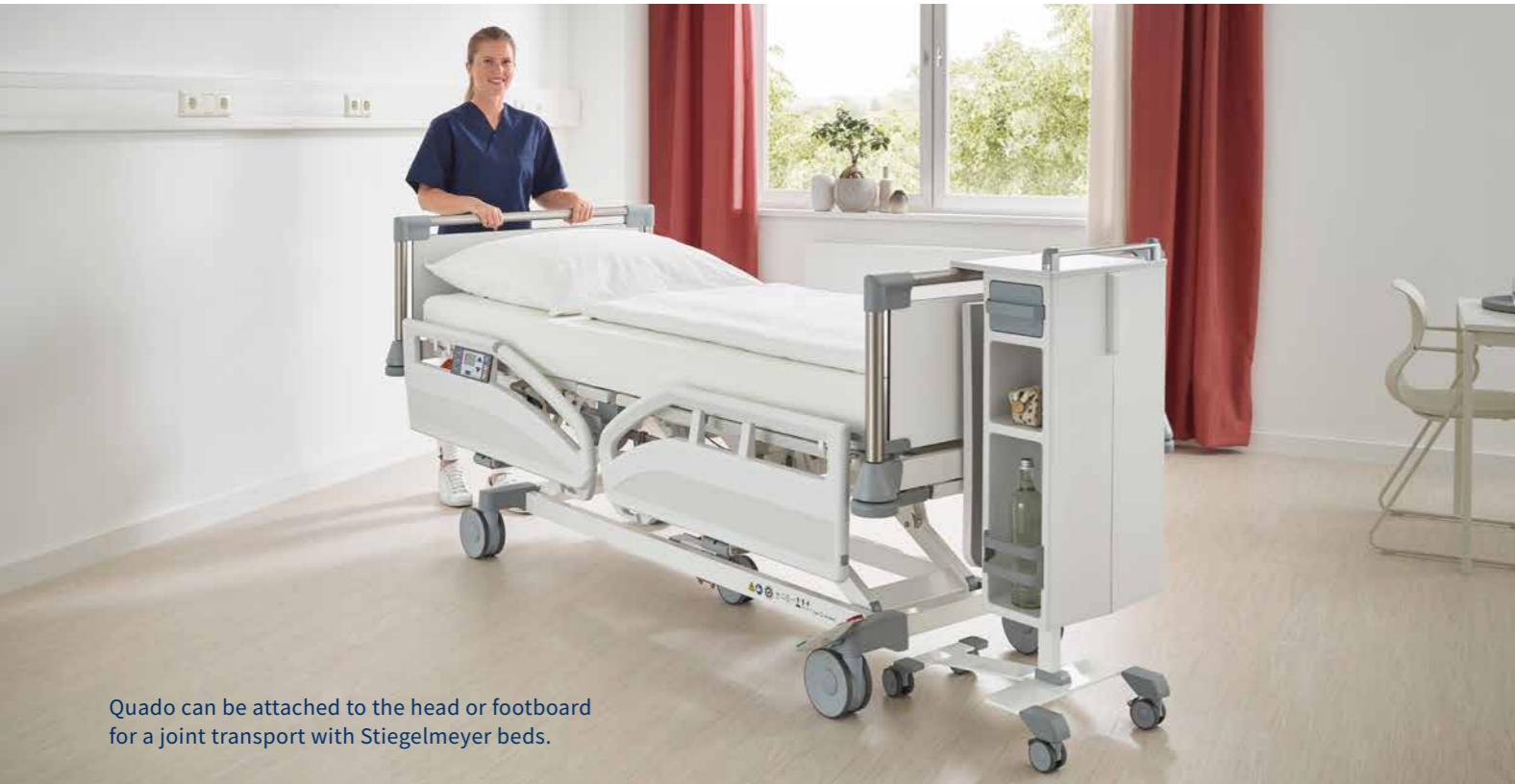
Quado can be attached to the head or footboard for a joint transport with Stieglmeyer beds.