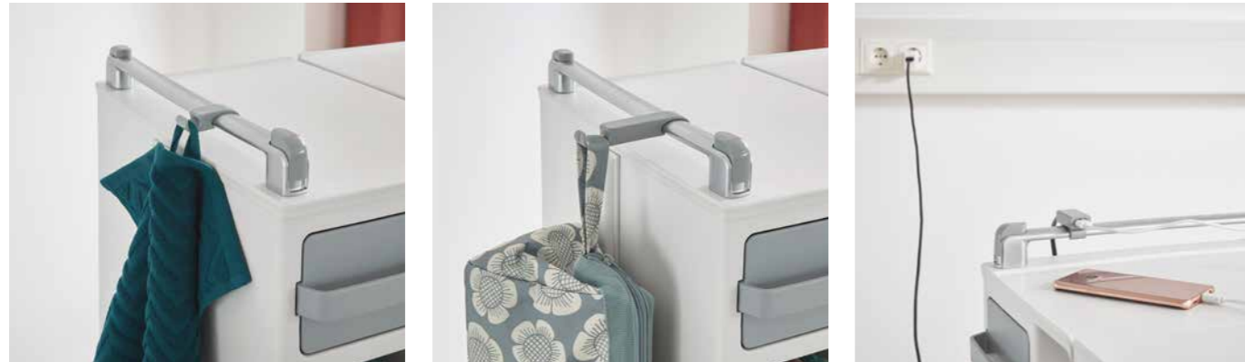
▲ With a towel hook on the rail of the bedside cabinet the towel is always at hand for the patient.