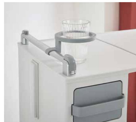
▶ The drink holder offers secure hold for glasses and bottles.