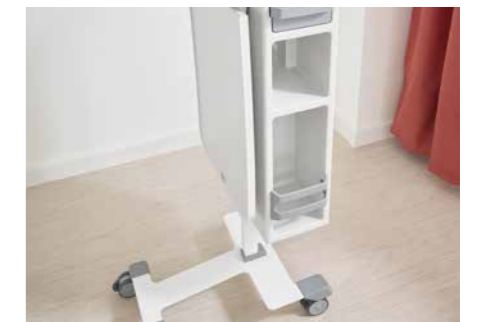
▲ The hygiene-friendly design of the Quado lends itself to easy and thorough reprocessing.