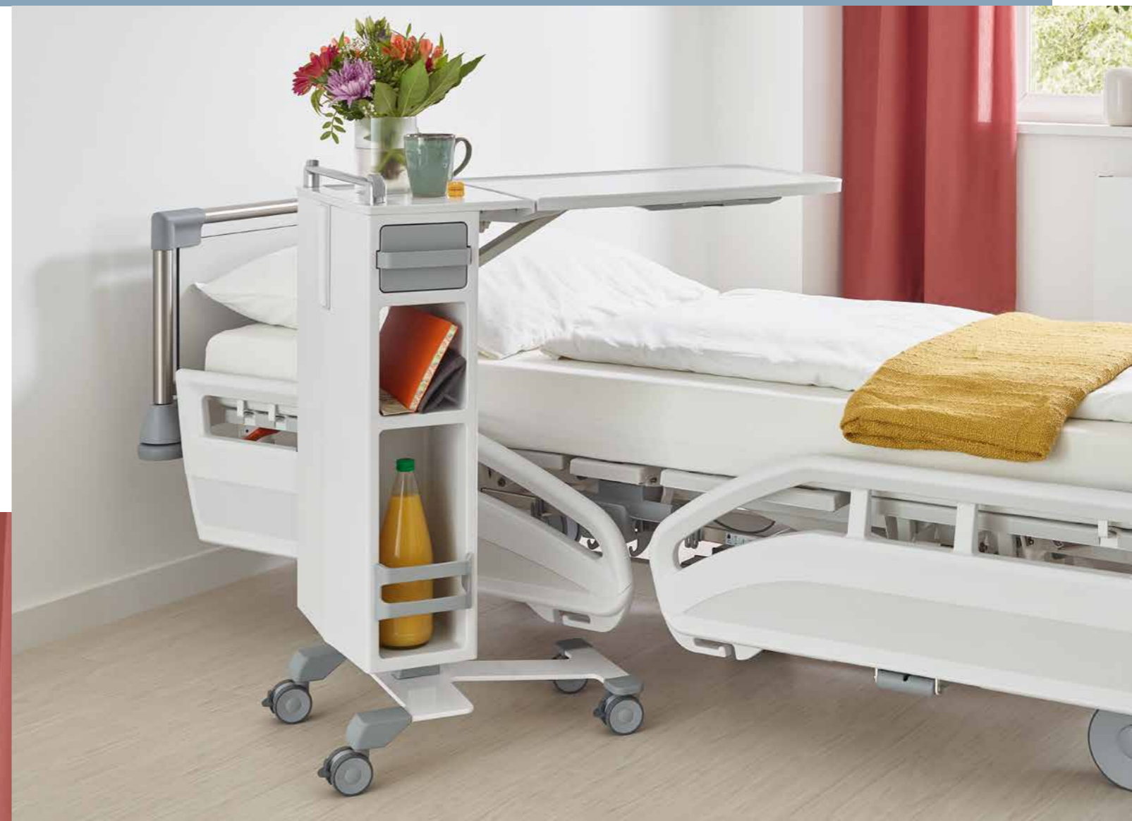
▲ With its neutral colours Quado adapts well to room furnishings and every hospital bed.

The new bedside cabinet Quado by Stieglmeyer is a real compact miracle. With its functions reduced to the most important ones it is particularly suitable for daily hospital routines. At the same time 2 open compartments on both sides and a drawer that can be opened to both sides offer enough storage space for the personal belongings of the patient. With its neutral colours Quado adapts well to room furnishings and every hospital bed. If the overbed table is not needed, it can be lowered easily and damped.