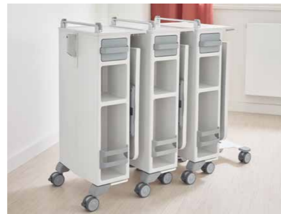
The Quado bedside cabinets can be pushed together for storage to save space.

height adjustment. Once the Quado has arrived at its destination, it can be safely parked next to the bed thanks to its castors with brakes.