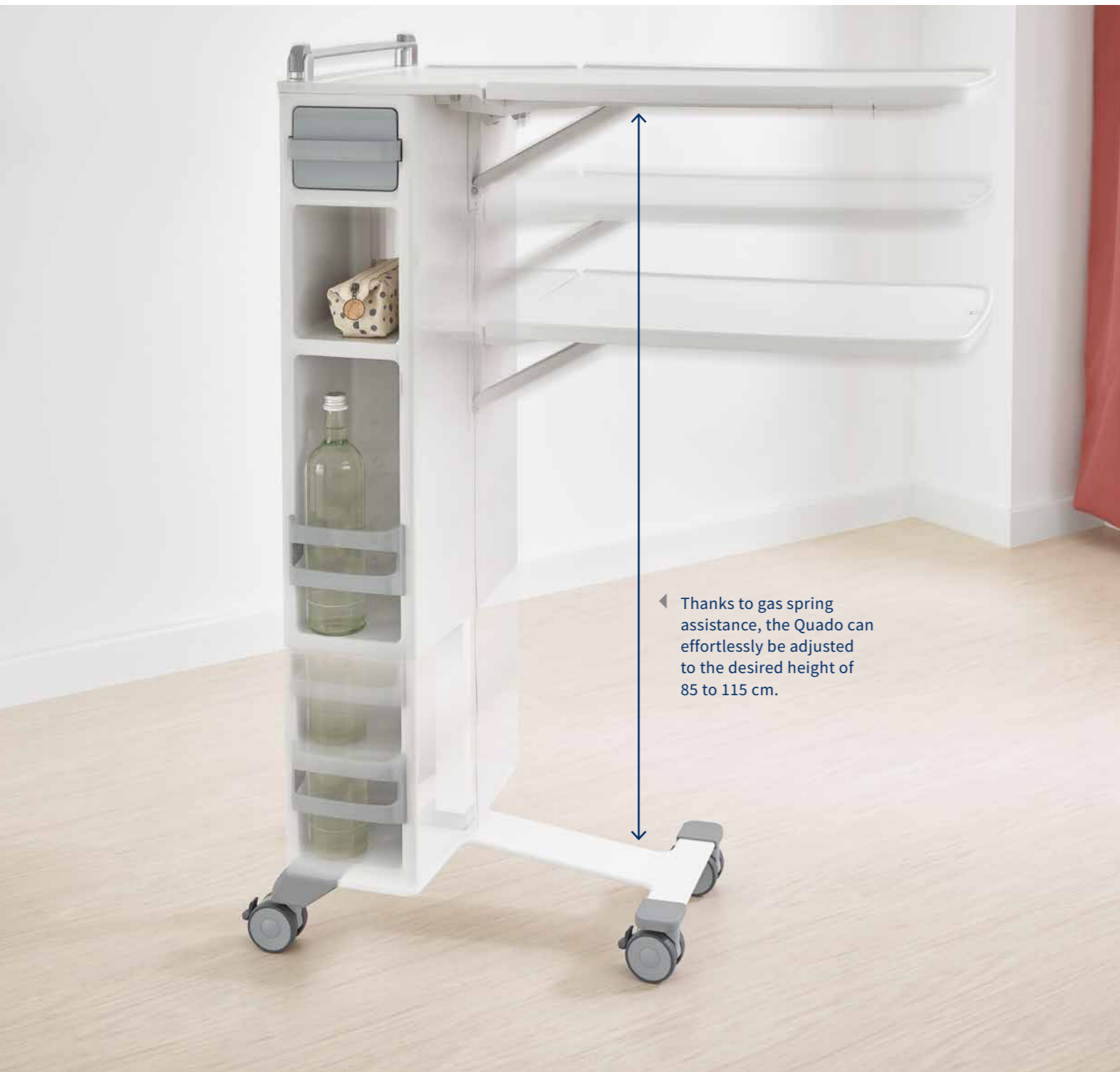
◀ Thanks to gas spring assistance, the Quado can effortlessly be adjusted to the desired height of 85 to 115 cm.