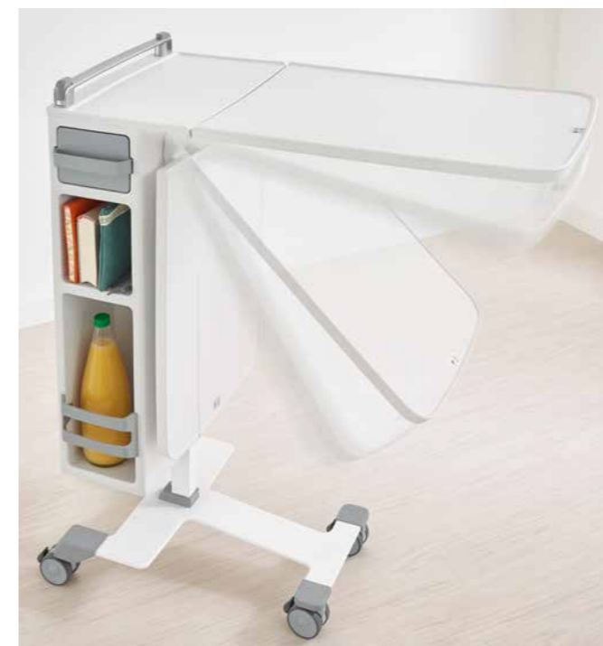
▲ The Quado's overbed table can be lowered easily and damped.